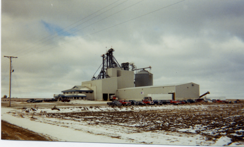
By the Interstate are "Big Gain of Wisconsin", a feed Processing plant, "RV World" a RV sales and service, "Best Western Motel", and "One Stop" a gas station and fast food.