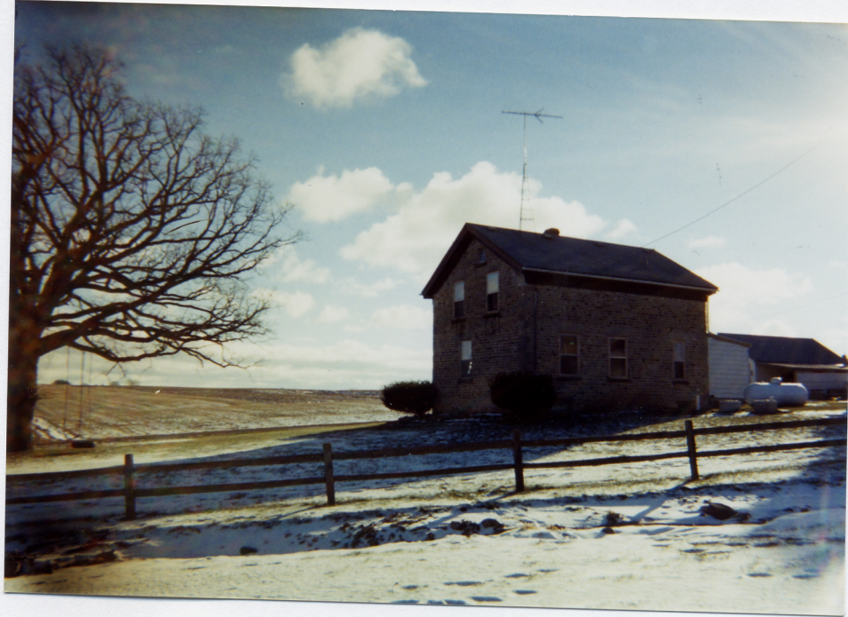
This home of located on The Manke Farm was built in 1862, out of field stone. According to historians It is the only on of its kind in this part of the state