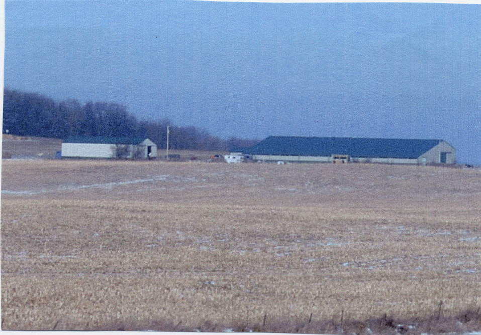
Horse arenas and stables are being built.