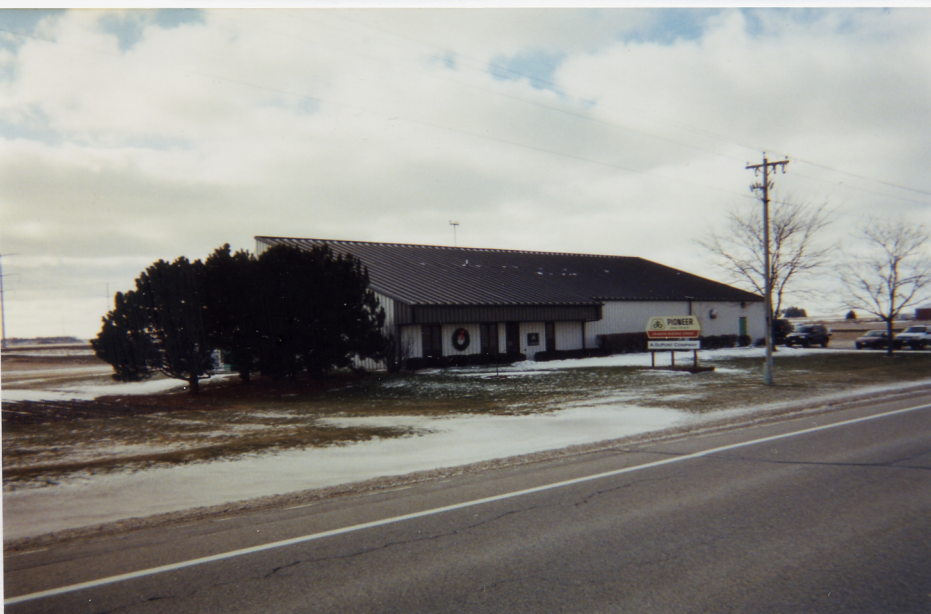
Pioneer Alfalfa research is located west of the Village of Arlington on Hwy 60.