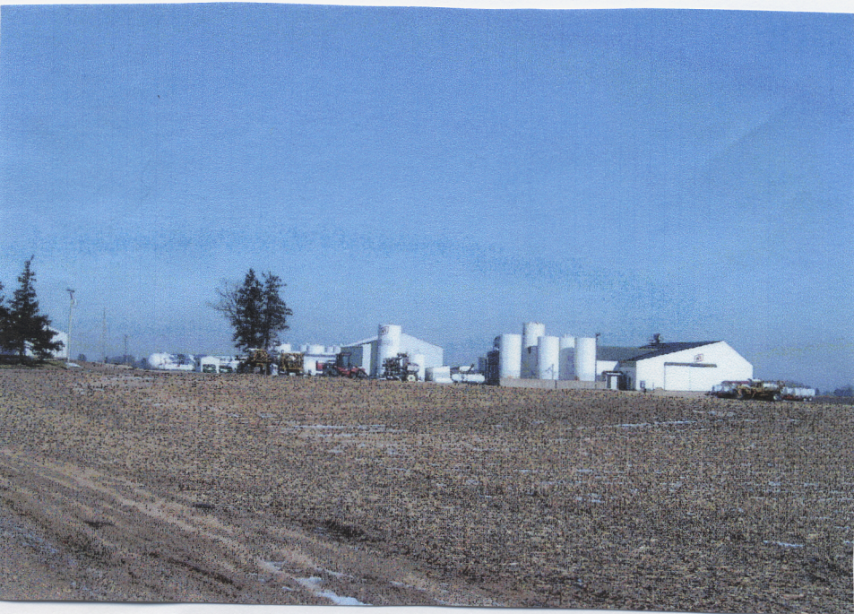
FS Fertilizer and petroleum are located south of Arlington.