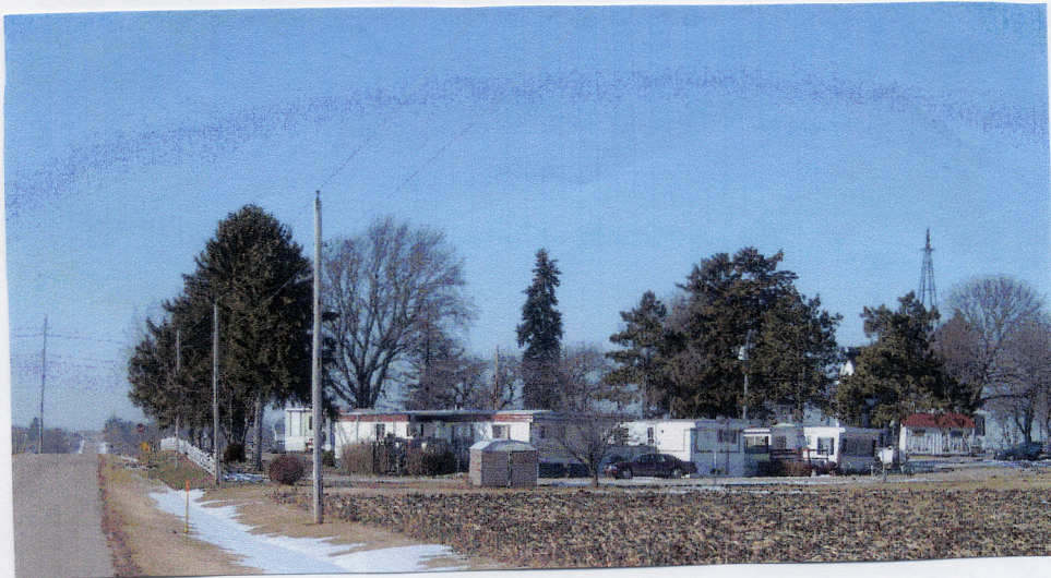
One trailer park.