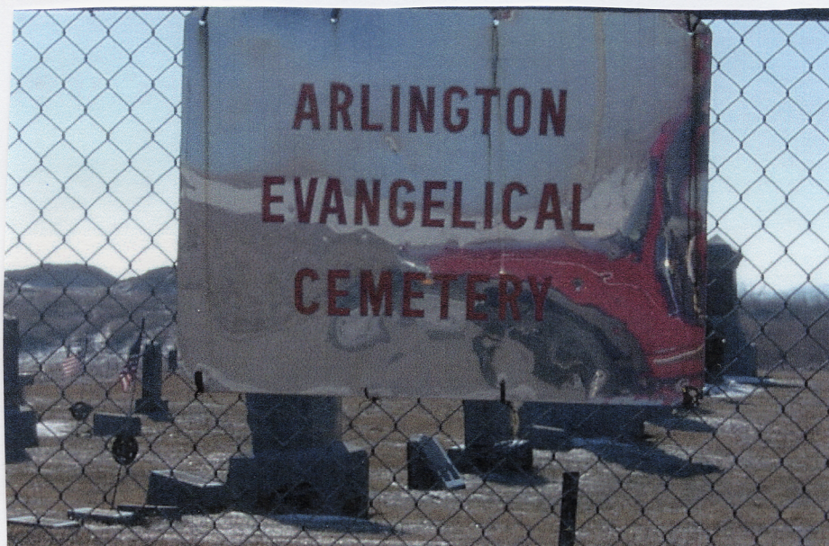
Arlington Evangelical Cemetery