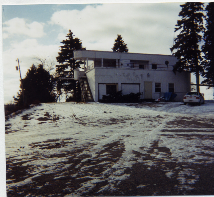
WIBU Radio Station

One of the oldest Radio stations in the State, located on WIBU Rd in Town of Arlington