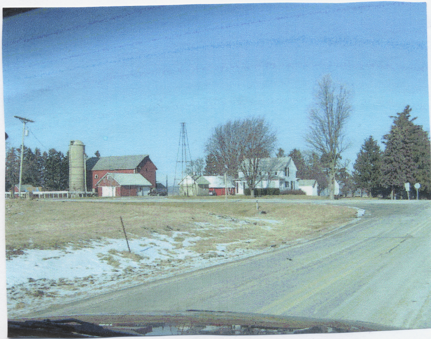
This farm is located in the center three miles in all four directions of the Town of Arlington. Notice the windmill that stands in this farm yard. These used to be used on all farmsteads and now you see very few even standing.

Also US highway 60 is the main dividing line of the Yahara Watershed and Wisconsin River watershed.