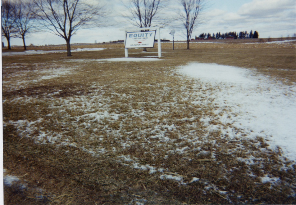
The town has many other types of businesses. Equity Livestock is located East of the Village of Arlington and takes in Beef, Hogs, and Sheep