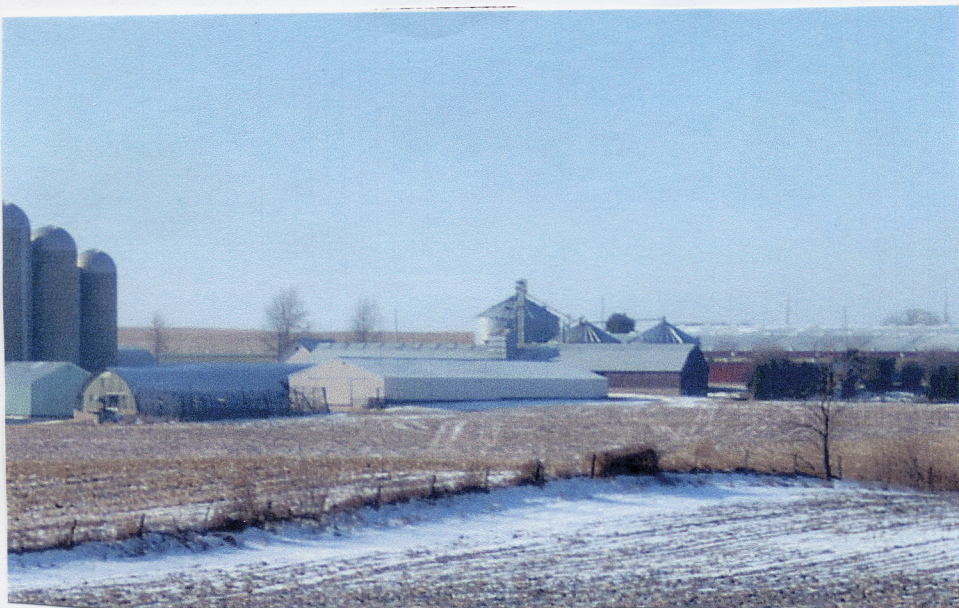
Barbian Brothers operate a large duck farm.