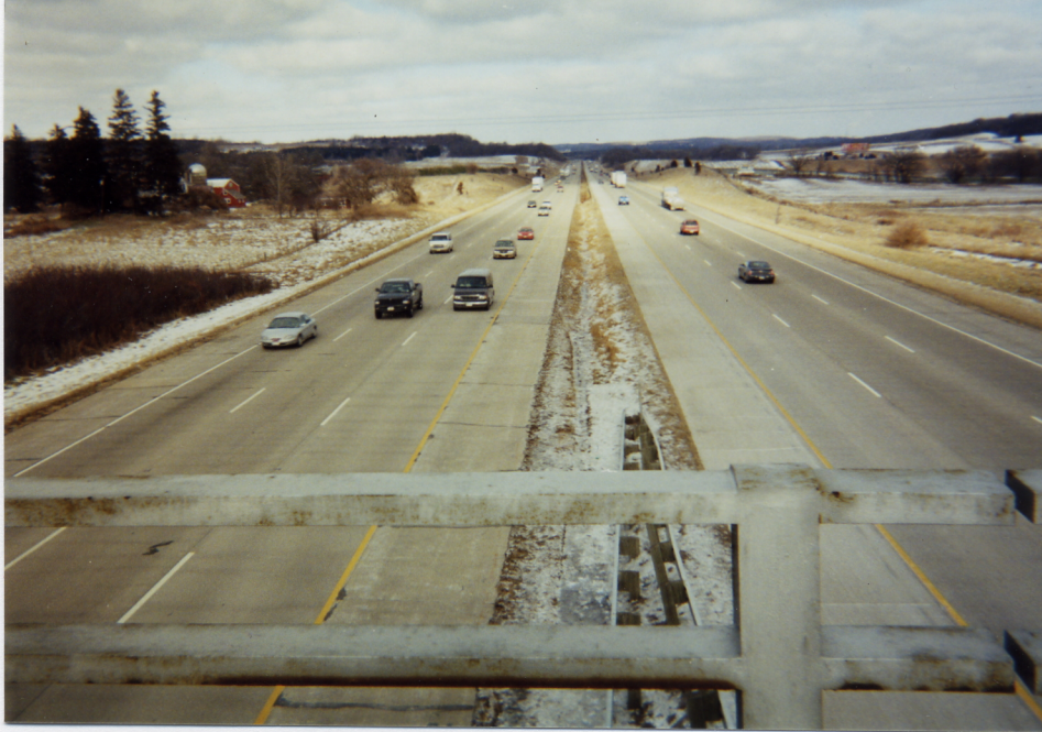
The Interstate cuts through the Town from north to south, with an exchange at US 60.