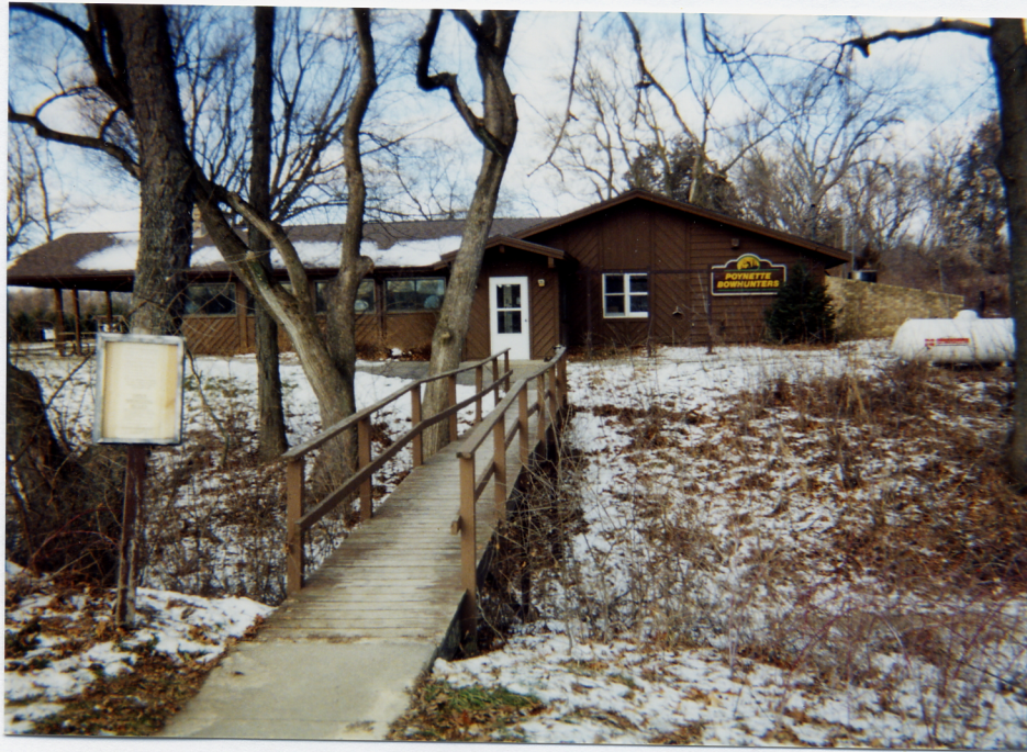
The Bow Hunters have a club house and target ranges located on Co Hwy Q.