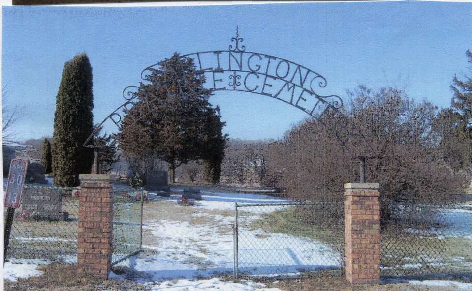
Arlington Prairie Cemetery