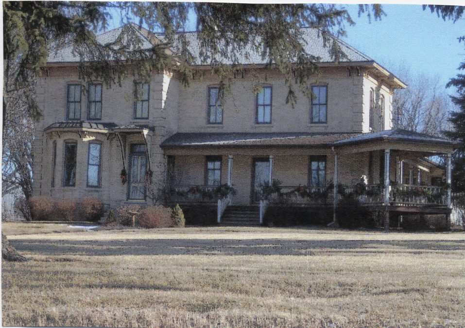
These two home are made of brick. One on the bottom is no longer occupied.