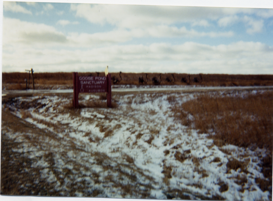
The waterless Goose Pond, is located on Goose Pond Rd. This is located south of Hwy 51.