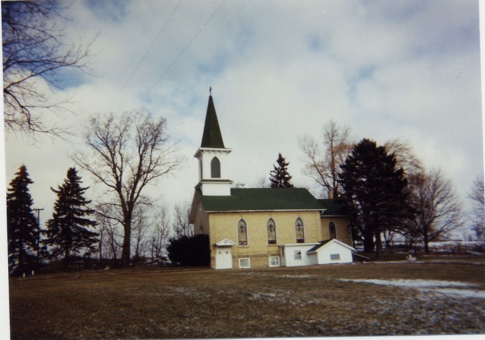
Arlington Prairie Lutheran

This is a picture of the only church in the Town of Arlington.