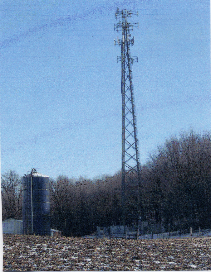
There are 3 cell phone towers within the town.